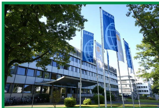
DAAD Headquarters Bonn, Germany

Deutscher Akademischer Austauschdienst German Academic Exchange Service